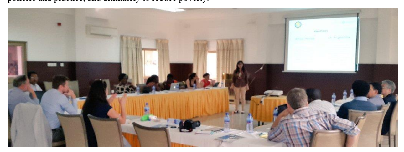
It is a four-year research project (Spt. 2014 to Jan.31, 2017) between OSSREA and Latin American Partner is Centre for the Implementation of Public Policies for Equity and Growth (CIPPEC) – a Research Think Tank based in Argentina.

The core objective of the project is that policy makers, policy influencers and practitioners in Africa and Latin American countries learn from Comparative Evidence from the two regions in order to inform their policies and practice, and ultimately to reduce poverty.