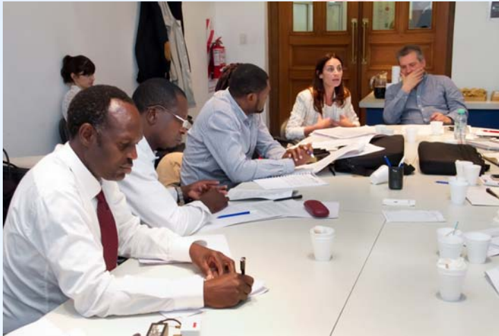
A session with a former National Deputy and a National Deputy. Member of the Mixed Committee of Public Accounts.