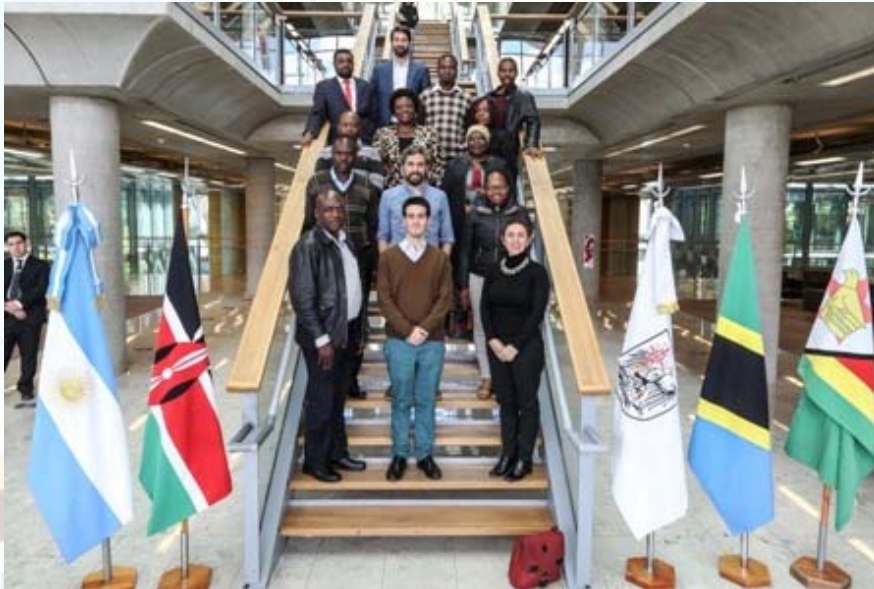
Picture Taken at the Government of the City of Buenos Aires building

The City of Buenos Aires is an Autonomous City with the rank of a province and thus entitled to local government. The purpose of the visit was to expose the team to Horizontal Accountability in the sub-national government. The meeting was held with sub national State representatives from the Executive who shared their commitments and the accountability strategy put in place.