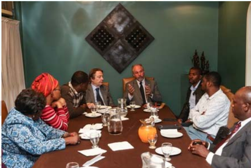
Round Table Meeting with Argentine specialists about African topics

The team travelled to International Affairs Argentine Council/CARI and met with specialists who focused on African topics related to South- South Cooperation. This space of interaction was dedicated resulted in an exchange views among colleagues about how South-South Cooperation is understood, how it is developed and how it could be improved since Latin America and Africa are regions with both similarities and differences in government and civil society. Additionally the specialists highlighted on governance aspects in Argentina.