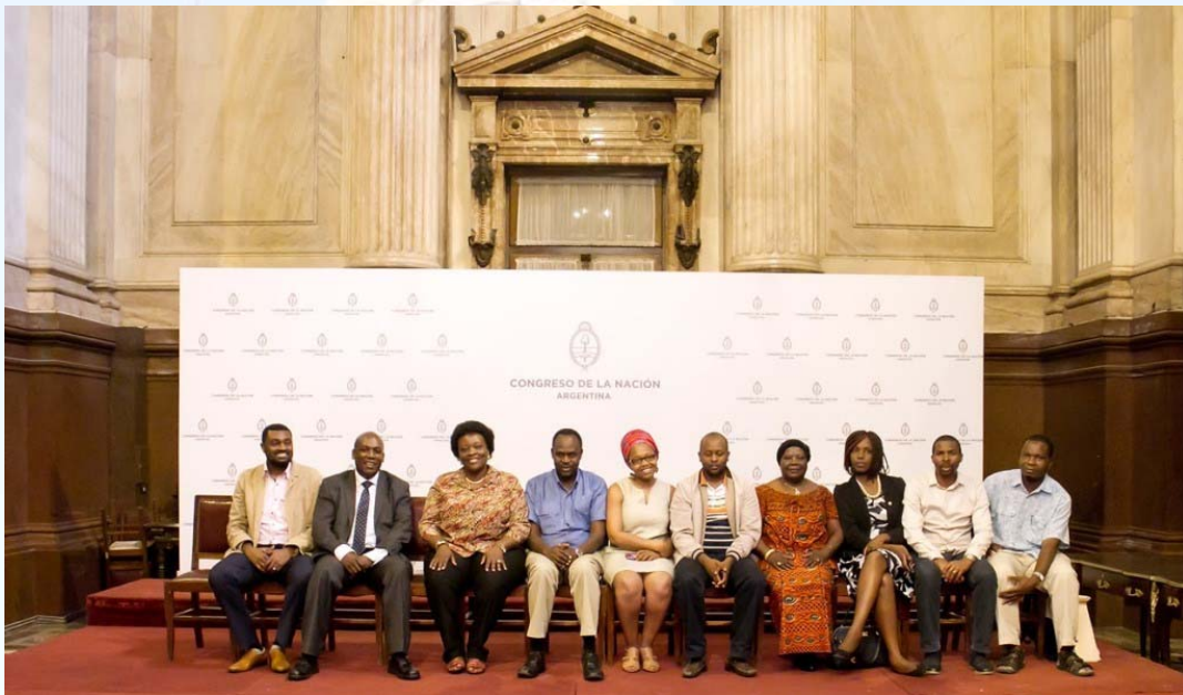
Picture taken at the National Congress

The National Congress was built during the first years of the 20 th Century. Its architecture is world-wide known. The participants were taken through a 90-minute guided tour will to the House of Deputies. This was to enable them discover and receive information about the history of the building and the Legislative power of Argentina.