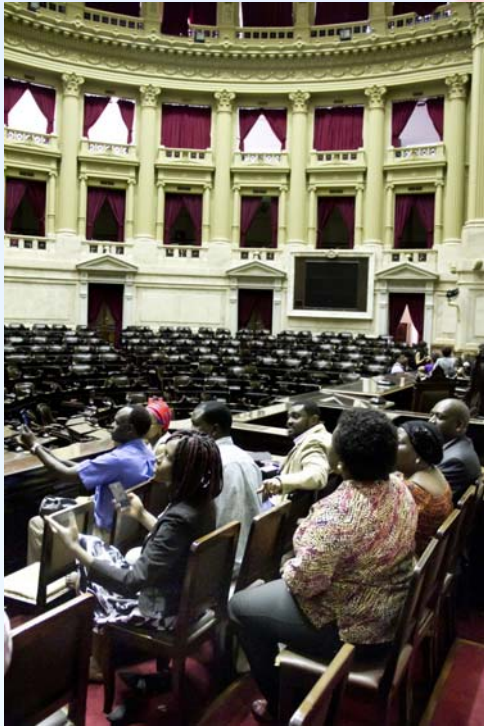
Picture taken at the House of Deputies